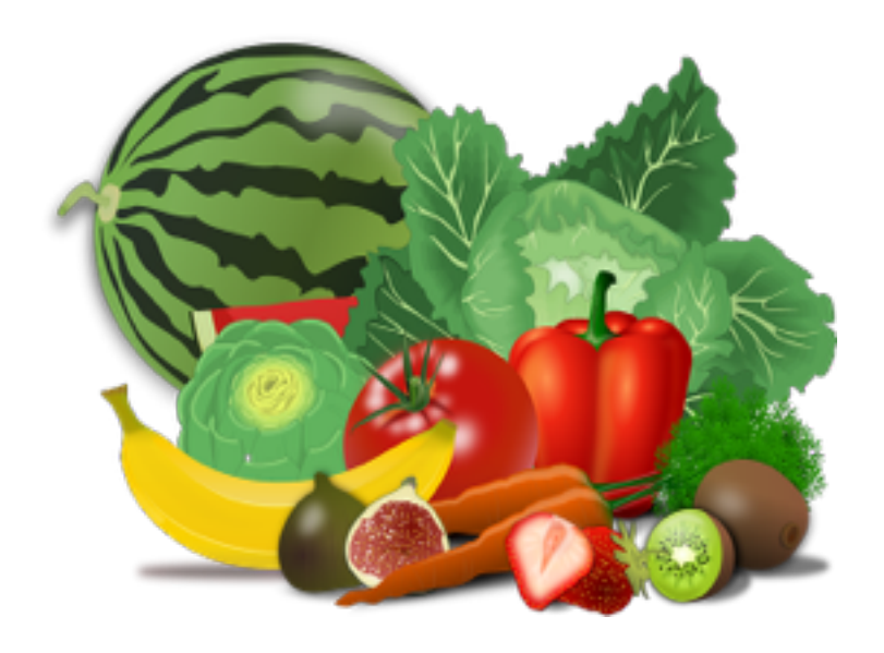
Page 4 I © Born to Grow 2019. All Rights Reserved.

NOTE: Make note that we live in the Southeastern USA. Most varieties will grow well in other locations as well but some may be especially suited to our location and climate.