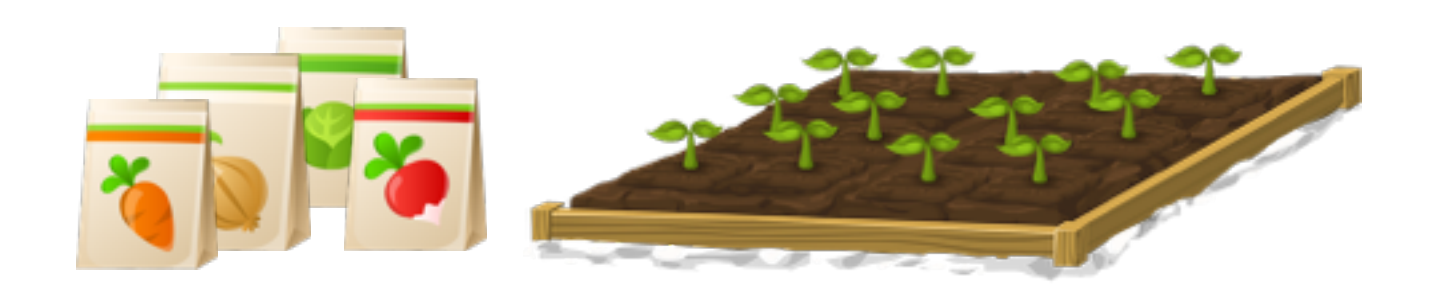
Page 2 I © Born to Grow 2019. All Rights Reserved.

The crops we like to transplant are labeled: T